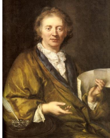
François Couperin (1668 - 1733)