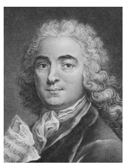
Jean-Marie Leclair (1697 – 1764)

FOLLIA is a baroque ensemble with a flexible combination of instrumental and/or vocal musicians as appropriate to the repertoire being performed.